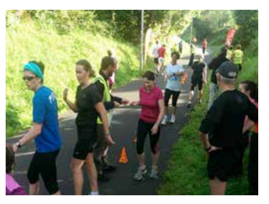
Pic: Participants finishing Westport parkrun