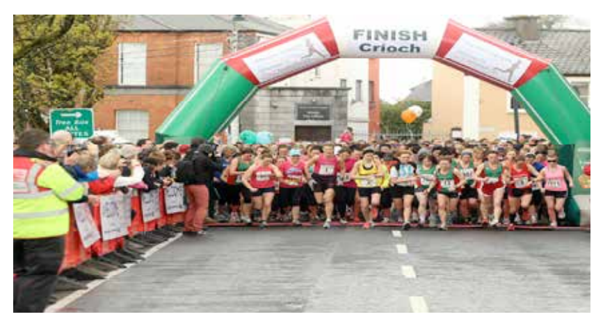
Sonia O Sullivan leads out participants in the 4th West of Ireland Womens Mini Marathon

The West of Ireland Womens Mini Marathon also provides a valuable boost to local businesses such as hotels, guesthouses and restaurants. As a result, a number of other LSPs have run their own Mini Marathon events based on the West of Ireland model. Additionally, each year MSP plays a vital role in the operation of Mini Marathon training groups, Couch to 5K and 10 for 10 programmes which prepare the thousands or so participants who are preparing for the big day.