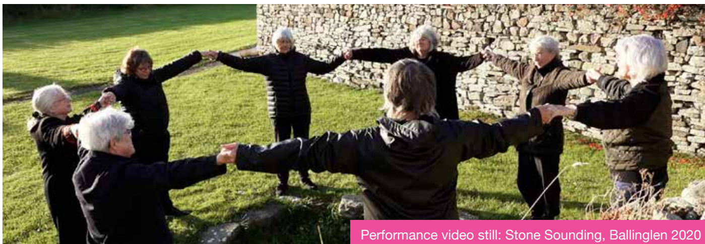
Performance video still: Stone Sounding, Ballinglen 2020