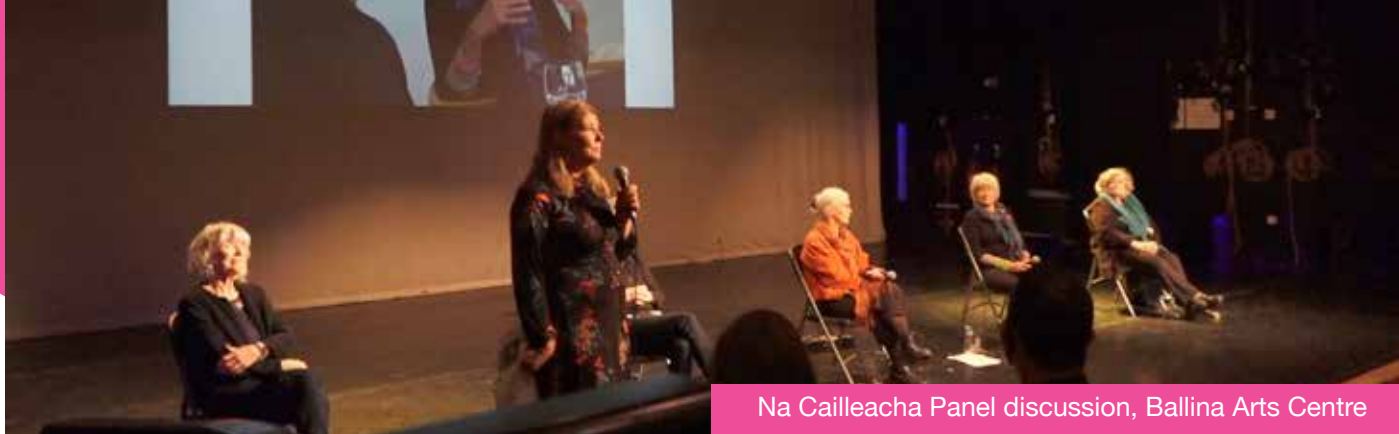
Na Cailleacha Panel discussion, Ballina Arts Centre