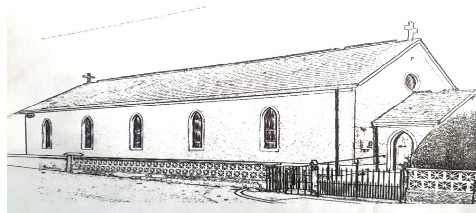
Holy Rosary Church, Glenisland