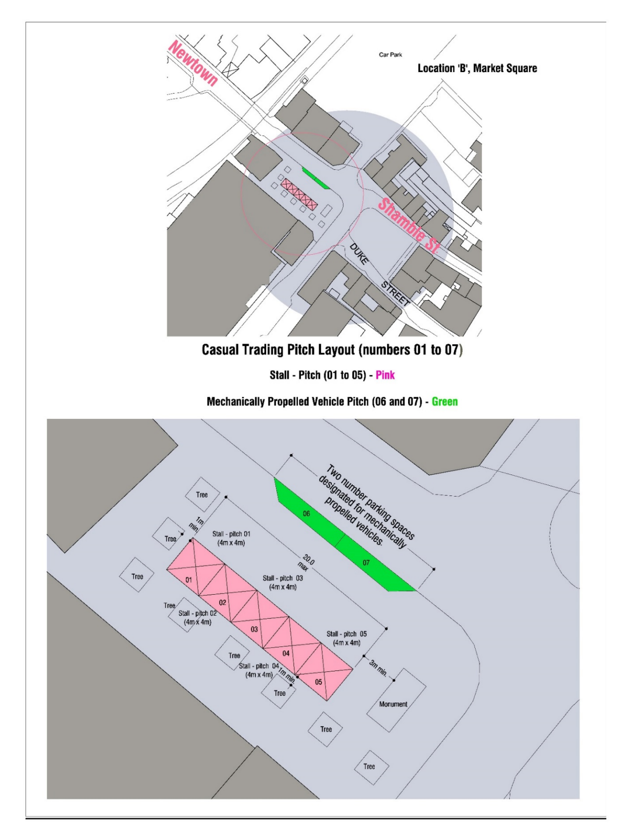
MAYO COUNTY COUNCIL - MUNICIPAL DISTRICT of CASTLEBAR - (CASUAL TRADING ) BYE-LAWS 2020 Designated Casual Trading Area 'B', Market Square