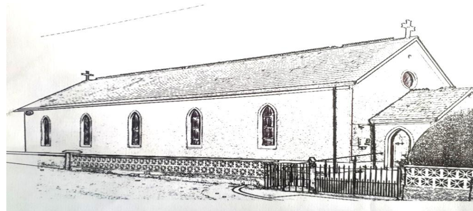
Holy Rosary Church, Glenisland