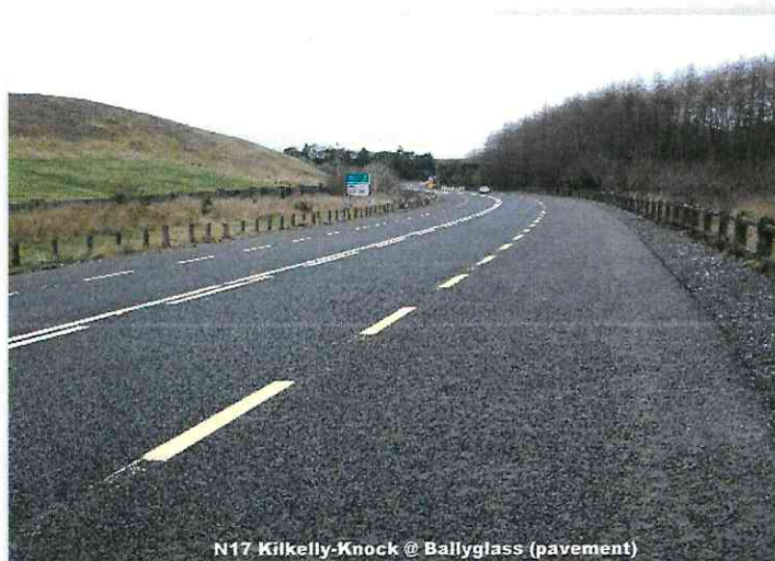
N17 Kilkelly-Knock @ Ballyglass (pavement)