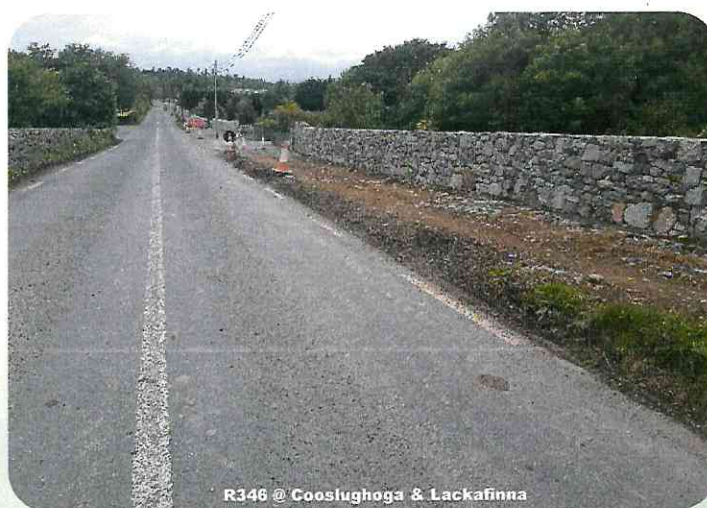
R346 @ Coosluhoga & Lackafinna