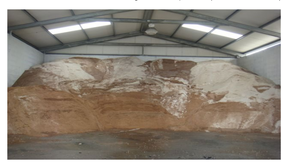
Figure 5: Salt storage barn

Salt will be stored in barns (Ballina, Castlebar, Claremorris & Kilkelly) or other designated indoor storage sheds (Ballinrobe & Westport) where possible. Otherwise salt should be stored outdoors in designated compounds (Achill & Belmullet).