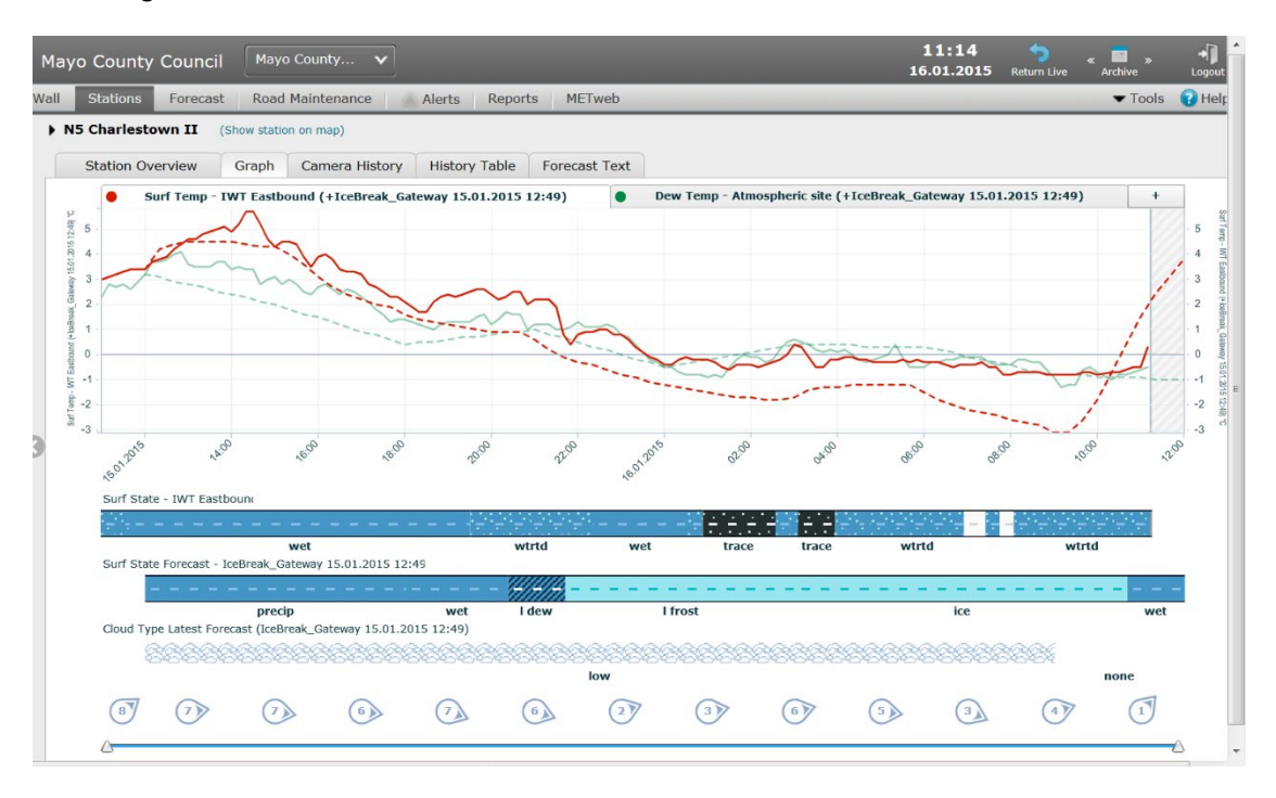
Figure 2: Vaisala weather station graph

The Duty Engineer will review the forecast information each day (usually available at 2.30pm). The Duty Engineer will then make and record the treatment decisions for the following 24 hours.