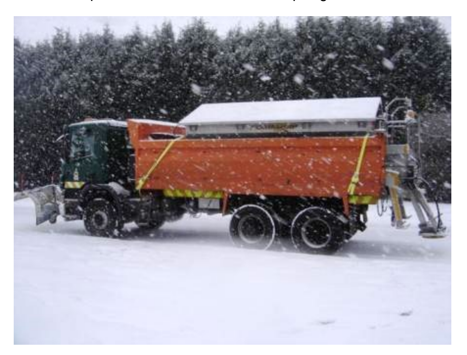
Figure 4: Demountable salt spreader

The spreaders are generally the demountable type with the 9 & 6m³ mounted on machinery yard trucks and the 2m³ mounted on Area pick-ups. The trucks carrying the 9 & 6m³ salt spreaders can also be fitted with ploughs for snow clearance when required.