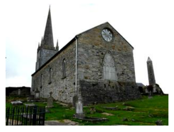
St Patrick's Cathedral with Killala Round Tower in the background

Killala and environs also has a rich ecclesiastical heritage including the prominent round tower in the town, Moyne Abbey, Rosserk Abbey, Rathfran Abbey, the Church of Ireland Cathedral, Meelick Castle, old graveyards, old bridges and the old railway line. Wildlife can be found in these old structures, birds and bats, mosses, ferns and lichens.