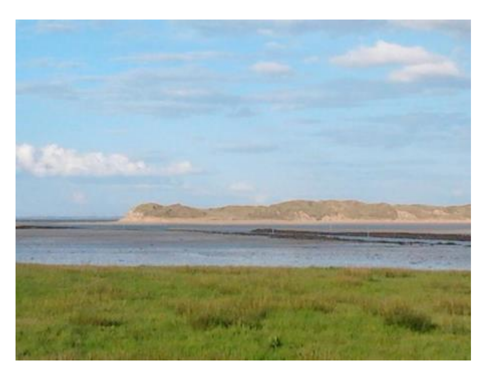
View of dune system on Bartragh Island

Out in Killala Bay, Seals, Dolphins and Porpoises can often be seen. The dune system on Bartragh Island is considered one of the best in the county because of the lack of disturbance. There are also sand dunes at Ross beach.