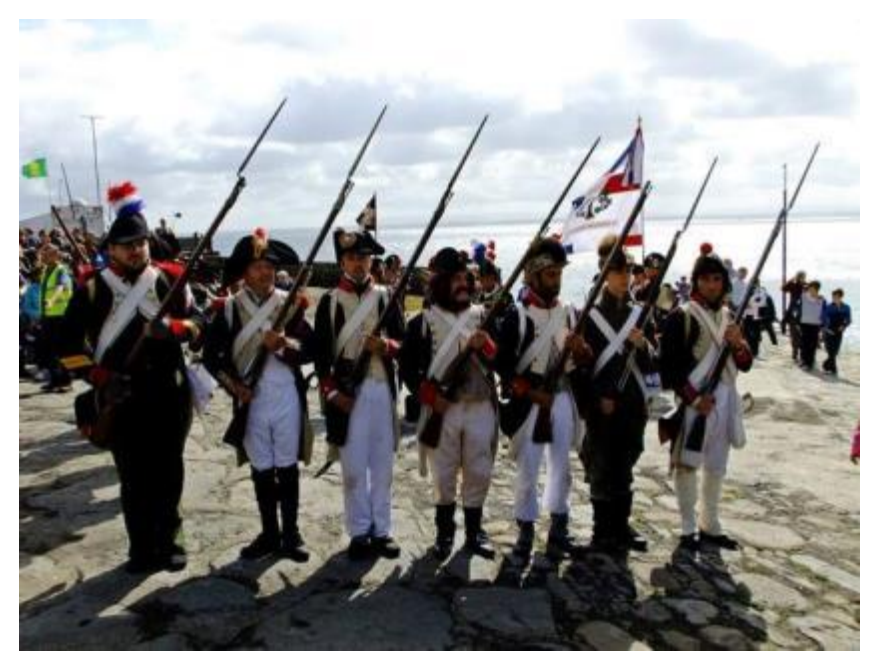
Re-enactment of 1798 French landing in Killala as part of The Gathering in 2013

There is a vibrant community in Killala as evidenced by the huge number of community groups active in the area. Many are working to improve local amenities and the local environment. The 'Killala Nature and Wildlife Plan 2014-2017' is an opportunity to learn more about the rich natural heritage in the area, to protect and enhance this wonderful resource for the benefit of nature and wildlife, visitors to the area and the local community.