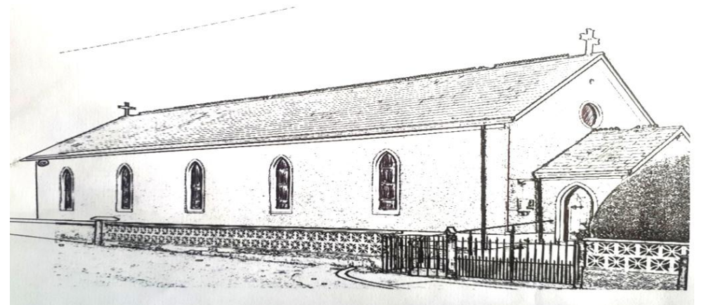
Holy Rosary Church, Glenisland