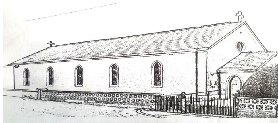
Holy Rosary Church, Glenisland