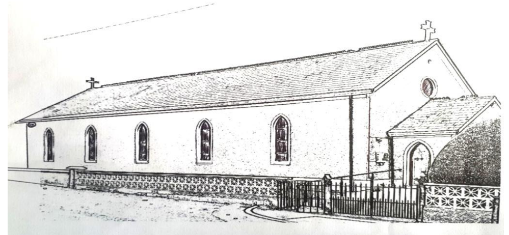
Holy Rosary Church, Glenisland