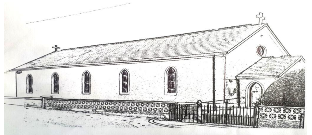
Holy Rosary Church, Glenisland