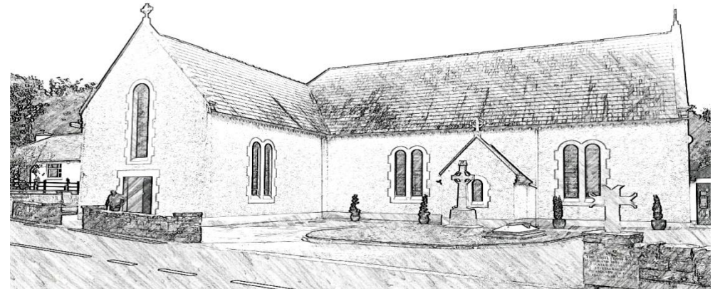
St. Patrick’s Church, Islandeady

Sunday 31 st Jan 2021 – Fourth Sunday in Ordinary Time