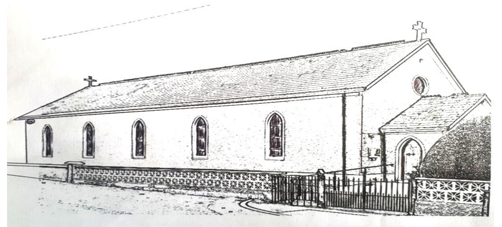
Holy Rosary Church, Glenisland